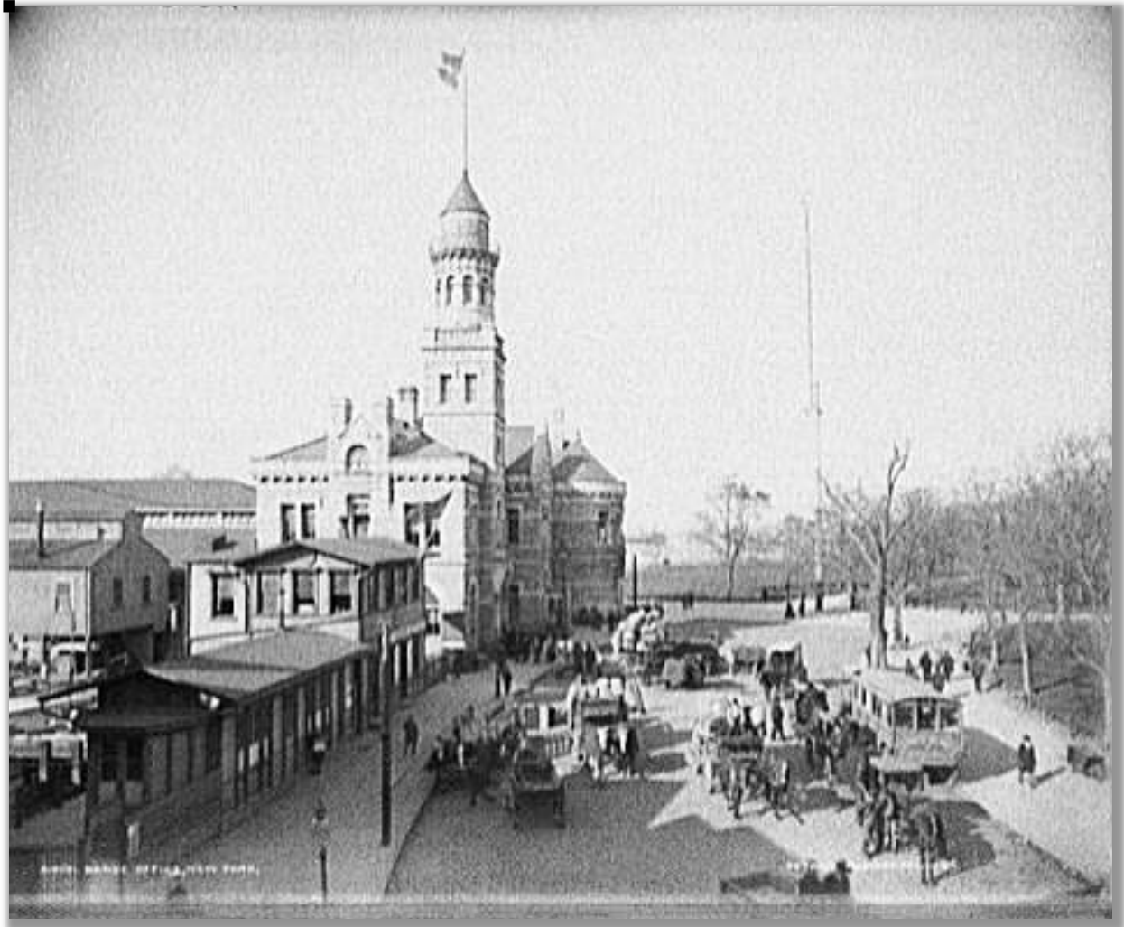
Figure 2: The U.S. Customs Barge Office in New York City was used as an immigrant processing center from April 1890 to December 1891; then again from 1897 to 1900. The building was originally built to house U.S. Customs passenger baggage examinations and provide workspace for U.S. Customs inspectors and staff.