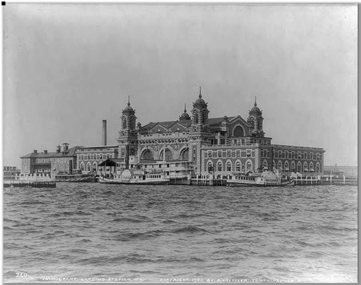
Figure 4: The rebuilt brick and steel Ellis Island Facility was opened in 1900 and operated until 1924. It is estimated that twelve million immigrants passed through the Ellis Island immigration facilities between 1892 and 1924. This image of the new facility was taken about 1905.