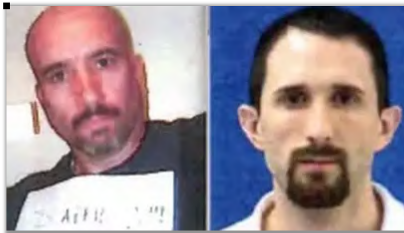
Figure 4: Former DEA agent Carl Force (L) and former USSS Agent Shan Bridges (R) pled guilty to stealing bitcoin from the Silk Road website. These former agents used various methods to extort and embezzle money from Ulbricht and the Silk Road website. (Source: Insider website, October 20, 2015, https://www.businessinsider.com/ex-dea-agent-sentenced-to-65-years-for-stealing-bitcoins-while-investigating-silk-road-2015-10 ).