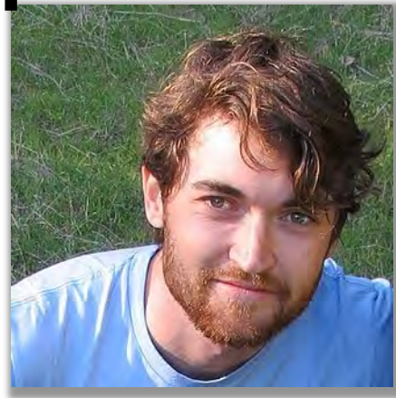
Figure 1: Ross Ulbricht, the 26-year-old founder of the Darknet illicit drug trading platform Silk Road. During the two years that Ulbricht operated the site, he became a multi-millionaire living on the run while operating the site from his laptop computer.