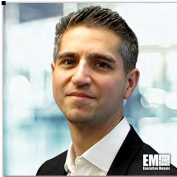
Figure 2: Former DHS Homeland Security Investigations (HSI) Special Agent Jared Der-Yeghiayan was the case agent on the Silk Road case. During the investigation, Agent Der-Yeghiayan was able to assume the identity of an Ulbricht confederate and communicated with him in an undercover capacity.