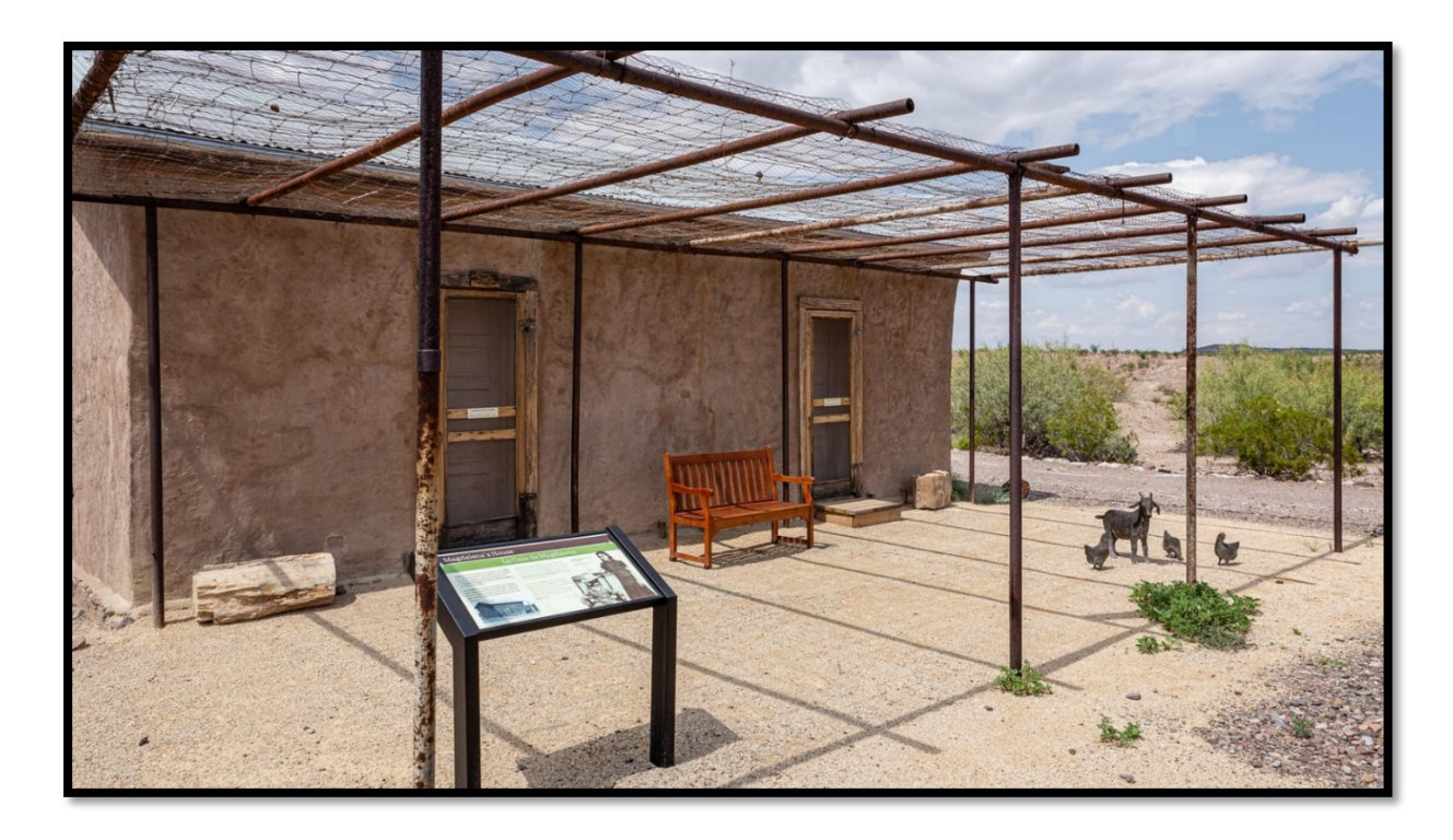
Figure 4: The former customhouse at Castolon, Texas was built in the early 1920s to serve as a Texas Ranger station and U.S. Customhouse. The building was later used as the residence of Magdalena Silvas who worked as a cook while raising five children in the home. The only sculptures in front of this customhouse are a goat and some chickens.