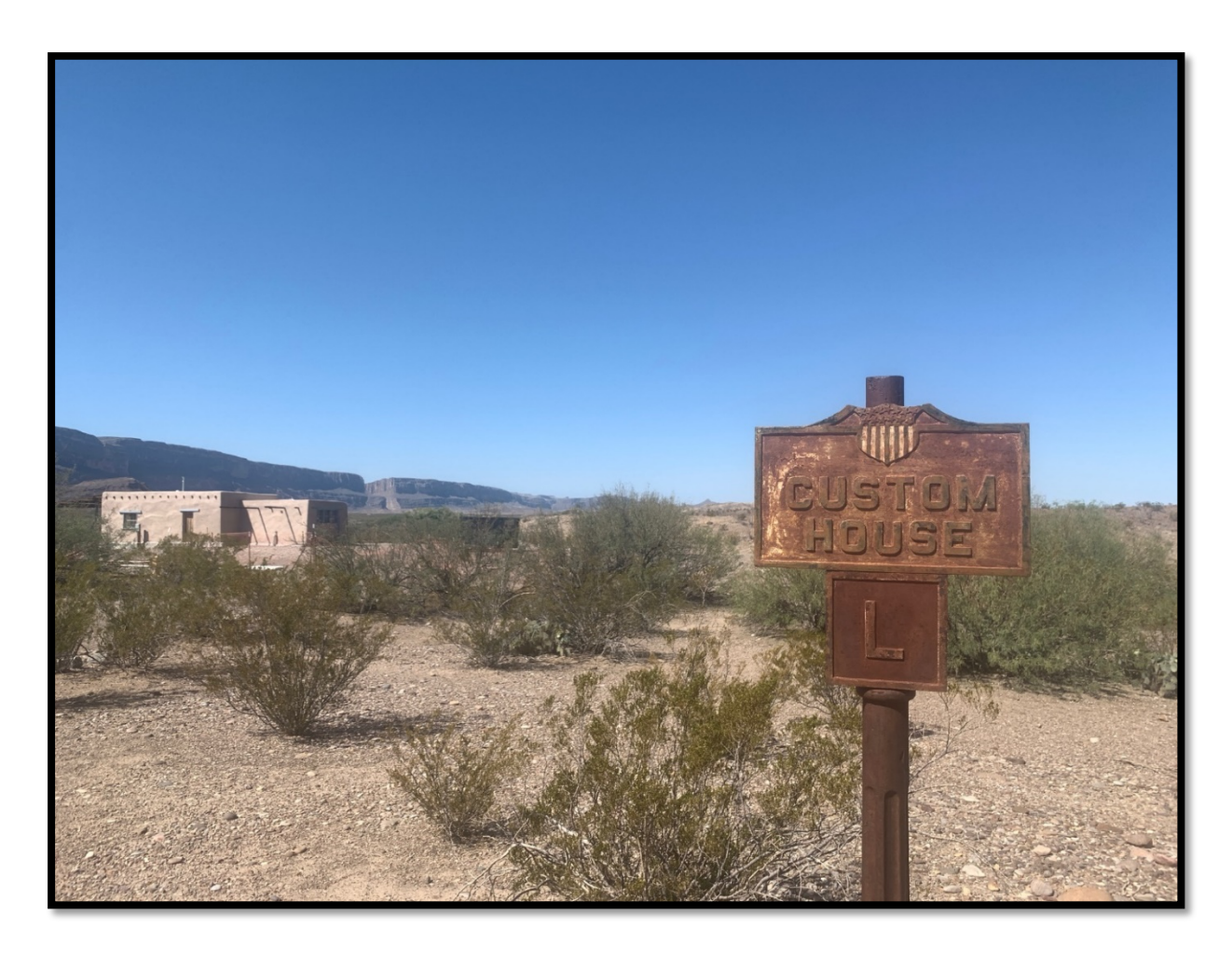
Figure 5: Metal signpost indicating directions to the U.S. Customhouse at Castolon, Texas. The building in the background is the Alvino House which is the oldest known adobe structure in Big Bend National Park. The gap in the mountains is Santa Elena Canyon which was cut by the Rio Grande River and is one of the most scenic areas of the park.