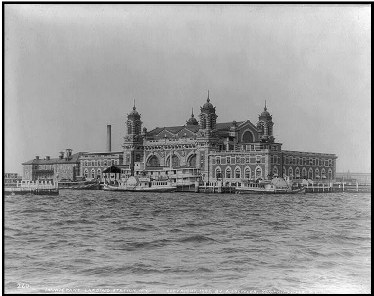
Figure 4: The rebuilt brick and steel Ellis Island Facility was opened in 1900 and operated until 1924. It is estimated that twelve million immigrants passed through the Ellis Island immigration facilities between 1892 and 1924. This image of the new facility was taken about 1905.