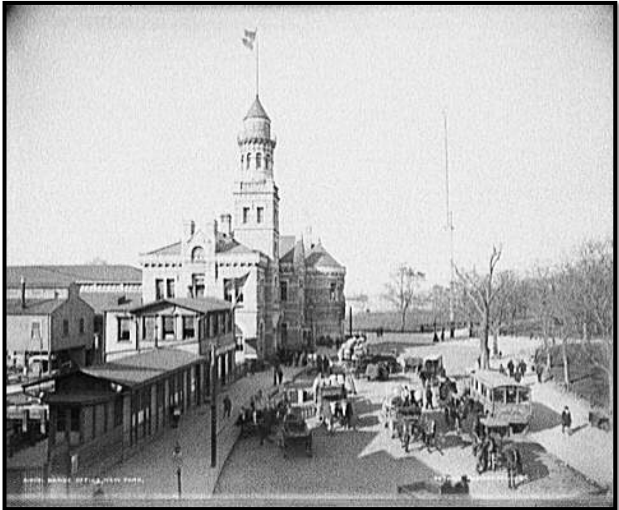
Figure 2: The U.S. Customs Barge Office in New York City was used as an immigrant processing center from April 1890 to December 1891; then again from 1897 to 1900. The building was originally built to house U.S. Customs passenger baggage examinations and provide workspace for U.S. Customs inspectors and staff.