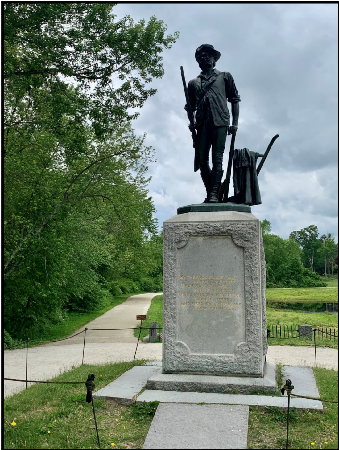
Figure 4: The Minute Man statue designed by sculptor Daniel Chester French was completed in 1847 and is located within the Minute Man National Historical Park in Concord, Massachusetts. The statue depicts a minuteman stepping away from his plow to join the patriot forces at the Battle of Concord. French's other designs include the four continents' statues on the Alexander Hamilton Customhouse in New York City and the Lincoln statue at the Lincoln Monument in Washington, D.C.