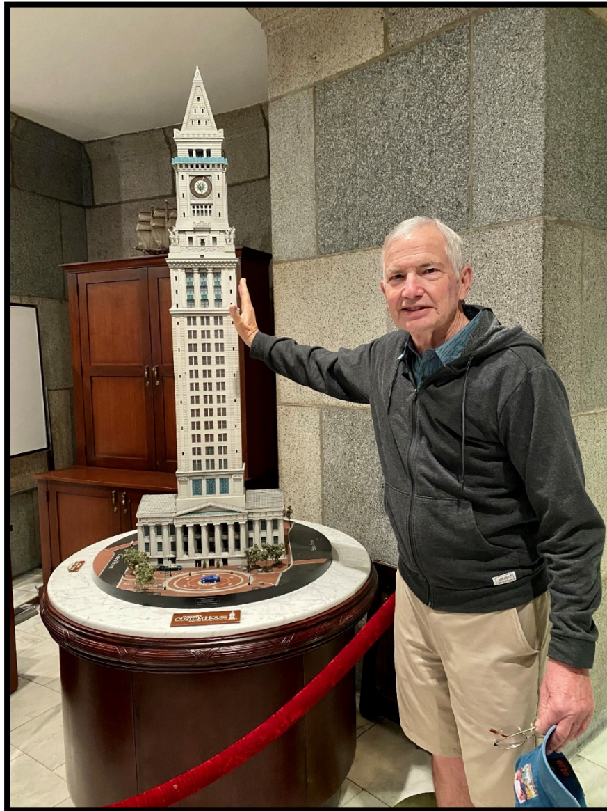
Figure 1: Old, retired U.S. Customs agent standing by a model of the old Boston Customhouse. This landmark building has been repurposed as a Marriott Resort. The bottom portion of the customhouse was built in 1849.