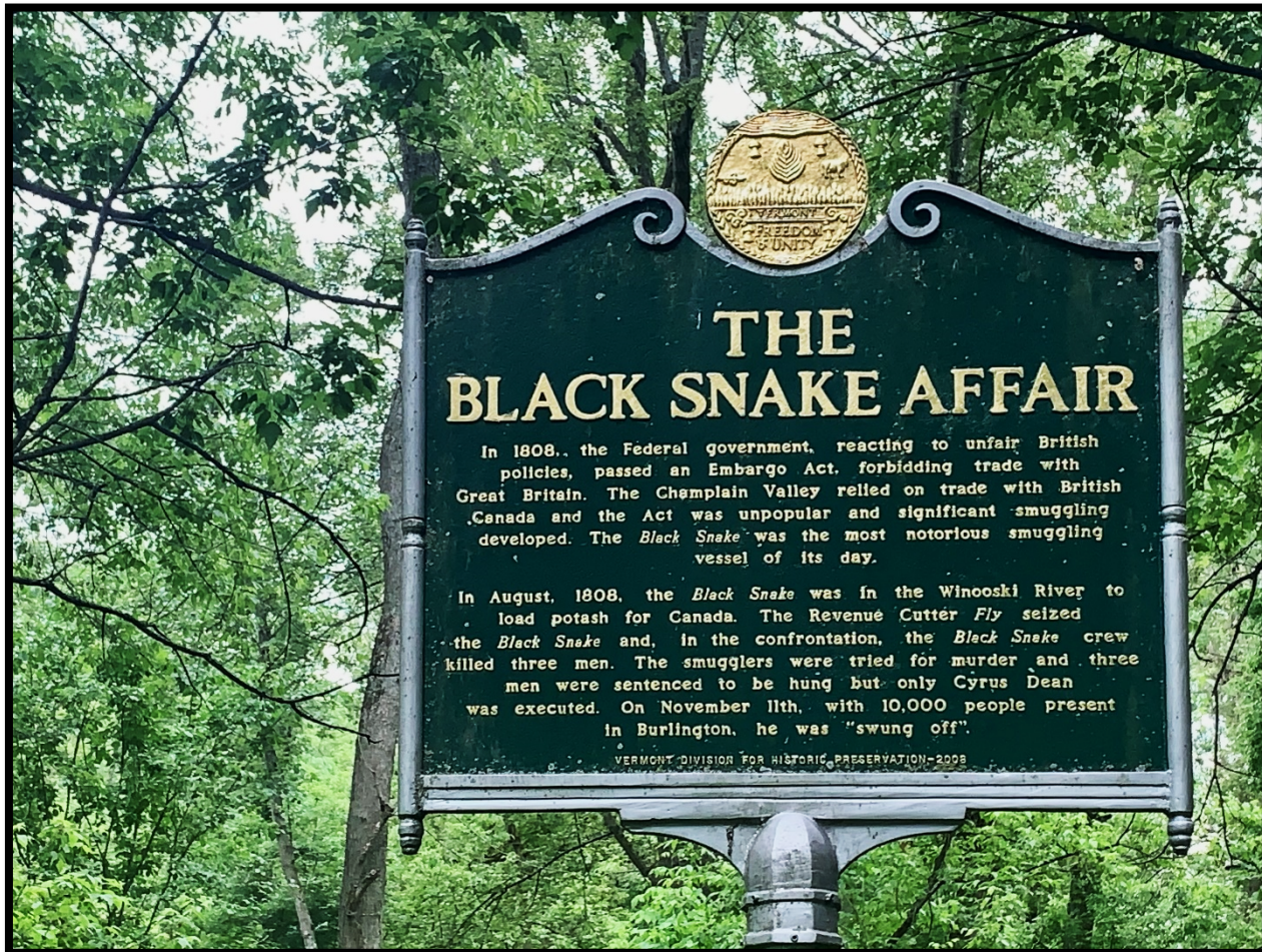
Figure 8: The Black Snake Affair historical marker is located near the site of the murder of three men killed during the Black Snake affair in 1808. Two of the men were Vermont militiamen assigned to U.S. Customs to prevent smuggling on Lake Champlain. These two men, Ellis Drake and Asa March, are considered the first U.S. Customs officers to die in the line of duty.