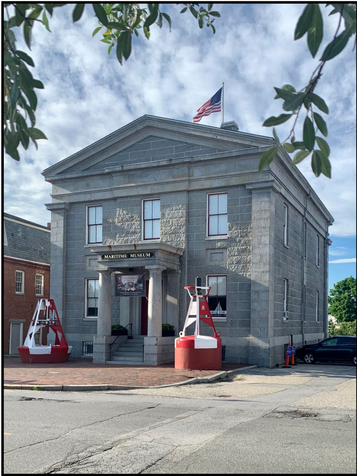
Figure 12: The former U.S. Customhouse in Newburyport, Massachusetts was built in 1834. This building is now the home of the Custom House Maritime Museum. The museum features an exhibit on the history of the U.S. Coast Guard. The Coast Guard considers Newburyport to be their birthplace because the nation's first revenue cutter was built at this port.