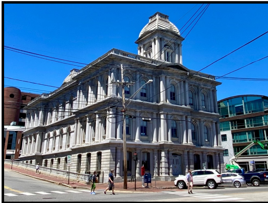
Figure 11: Former U.S. Customhouse in Portland, Maine was built from 1867-1872. The customhouse was built in a combination of the Second Empire and Renaissance Revival styles. In 2012, CBP relocated to a new location.