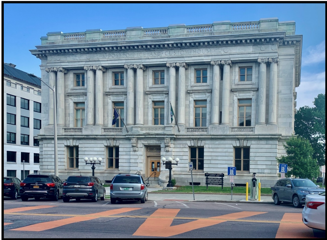
Figure 6: This former U.S. Customhouse in Burlington, Vermont was built in 1906 in the Beaux Arts style. The building was vacated by U.S. Customs in 1960 and it now serves as the Chittenden County Superior Courthouse.