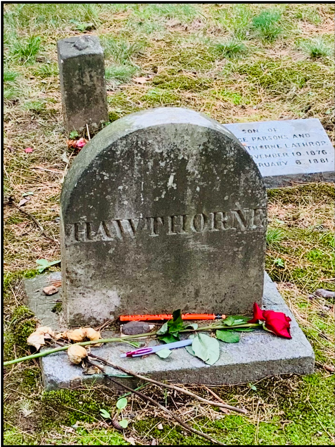
Figure 5: Gravesite of author and former U.S. Customs officer Nathaniel Hawthorne located on Author's Ridge in the Sleepy Hollow Cemetery in Concord, Massachusetts. Hawthorne's home, Wayside House, is in the Minute Man National Historical Park in Concord.