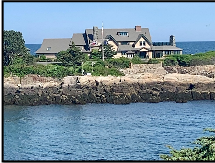
Figure 10: The George H.W. Bush compound is located on Walker Point in Kennebunkport, Maine. President Bush and his wife Barbara spent summers with their family at this location. President Bush led Operation Florida and played a major role in the development of the U.S. Customs Blue Thunder watercraft.