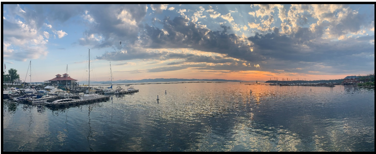
Figure 7: A view across Lake Champlain from Burlington Harbor. The Adirondack Mountains of New York are in the distant background. This lake has been used to smuggle contraband goods both into and out of Canada.