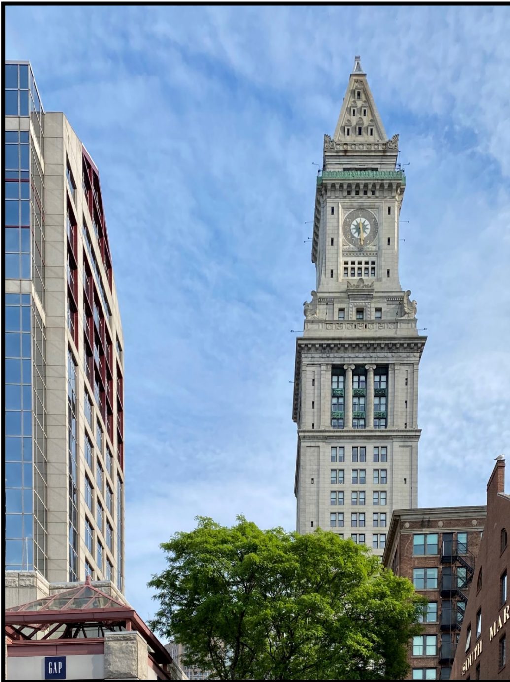
Figure 2: Street view of the former U.S. Customhouse in Boston. The tower you see was added to the original building in 1915. For over 50 years, this was the tallest building in New England.