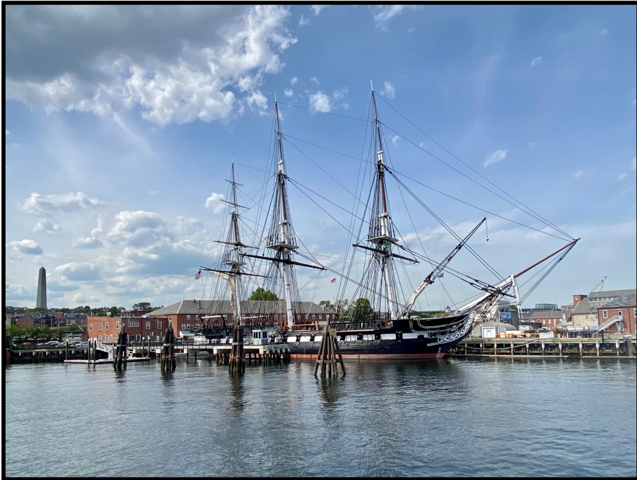
Figure 3: The USS Constitution also known as "Old Ironsides" was launched in 1797 in Boston. The ship became famous for her actions during the War of 1812. She is still in active service and is berthed at the former Charlestown Navy Yard-Boston National Historical Park.