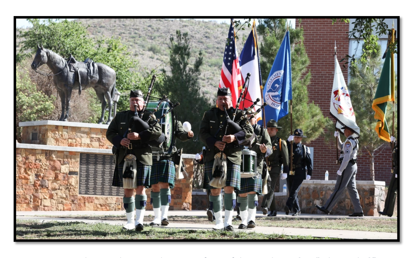
Figure 4: CBP Border Patrol Pipes and Drums in front of the Donde Esta? or "Where is he?" memorial during a remembrance ceremony in 2021.