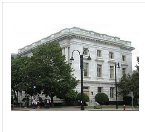
The western facade in 2013