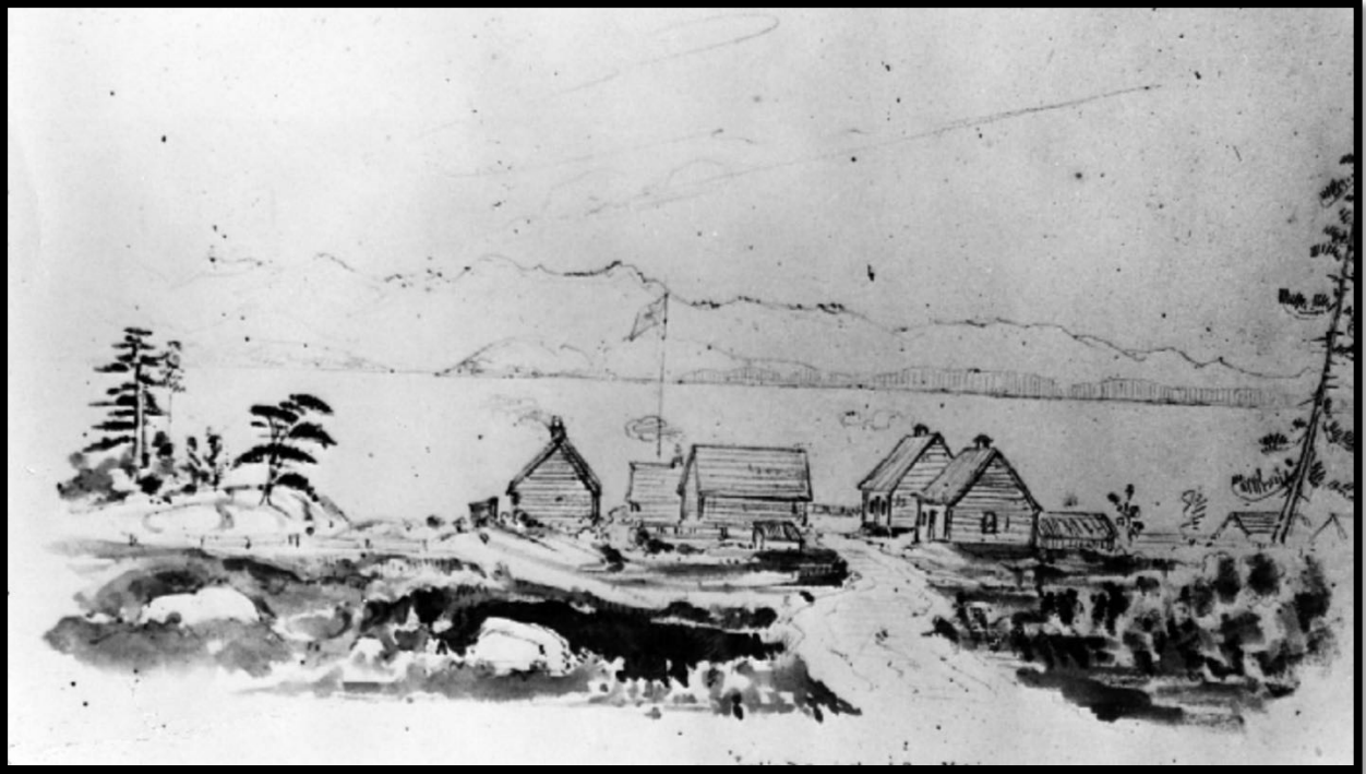
Figure 2: Belle Vue Sheep Farm on San Juan Island where the 1854 border dispute involving Collector Ebey, Inspector Webber and British officials occurred. It took eighteen additional years for the dispute to be settled in favor of the United States.